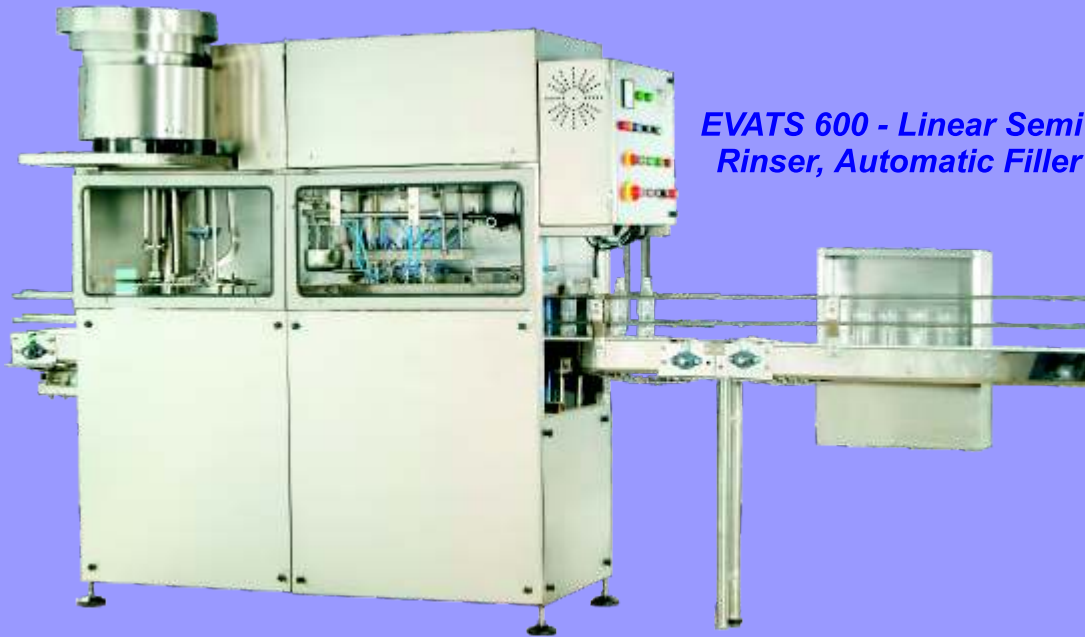
EVATS 600 - Linear Semi Automatic Rinser, Automatic Filler & Capper