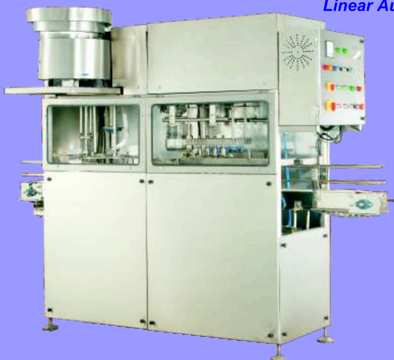
EVATS 600 Linear Automatic Filler & Capper